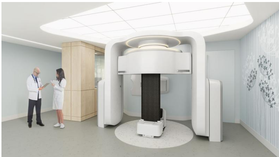
Image of treatment room with Leo’s upright patient positioning system

UW Health broke ground on Eastpark Medical Center in May and it is expected to open in 2024.